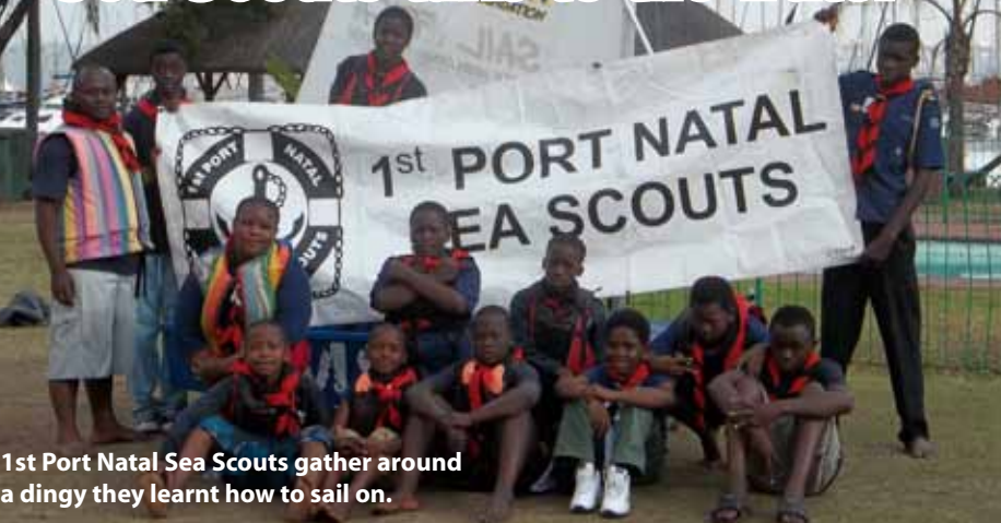
1st Port Natal Sea Scouts gather around a dingy they learnt how to sail on.